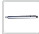
extension rod (included)